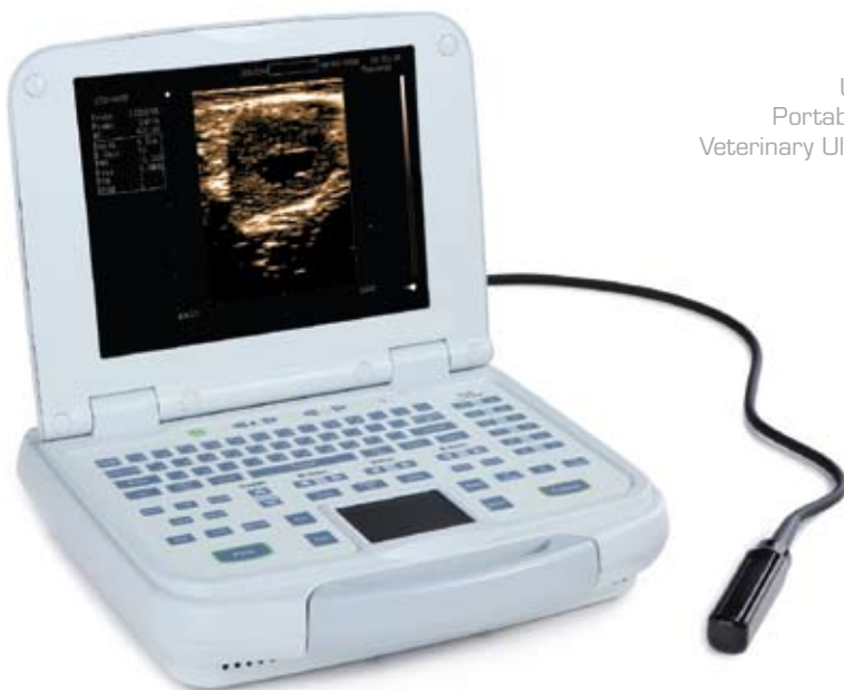
UMS900 Portable Digital Veterinary Ultrasound