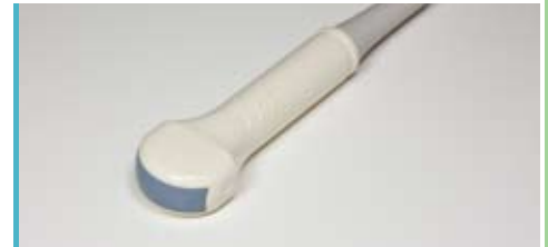
C6115H: Micro-convex, 4.5 - 7.5 MHz