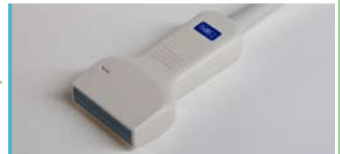
L7138H: Linear T-Probe, 5.0 - 10.0 MHz