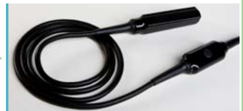
L5165VH: Rectal, 3.5 - 7.0 MHz (features on-cord freeze button)