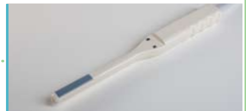
U5150H: Llama, 3.5 - 6.5 MHz