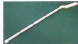
5-9 MHz Endocavity 33 inches long