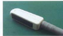
5-9 MHz 40mm Tendon/Rectal Probe