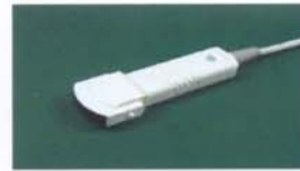
4-6 MHz Convex Abdo/Cardiac