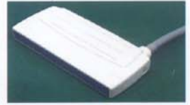
2.5-5.0 MHz 17cm Backfat Probe