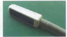
5-9 MHz 60mm Tendon/Rectal Probe