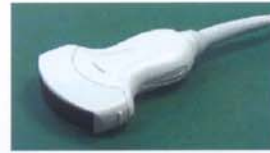
2.5-5.0 MHz Convex Probe Abdo / Cardiac