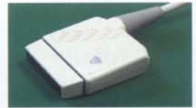
5-9 MHz Tendon Probe