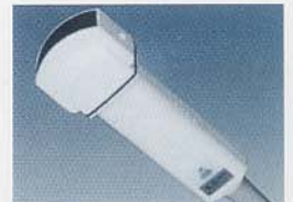
5.0 MHz 40R (4/5/6) Convex Array (Dogs/Equine)