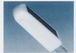
5.0 MHz 65mm (4/5/6) Rectal/Tendon