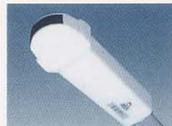
6.5 MHz (5.5/6.5/7.5) Microconvex (Cats/Pasterns)