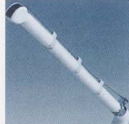
6.5 MHz 20R (5.5/6.5/7.5) Equine/Bovine, Llama/Swine Miniature Horses (55 cm) Oocyte Retrieval/Vaginal Probe