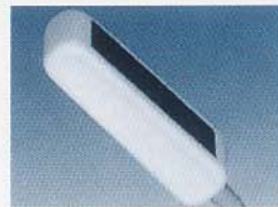
3.5 MHz 85mm (2.5/3.5/4.5) Rectal Deep Penetration