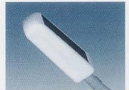
7.5 MHz 60mm (6.5/7.5/8.5) Rectal/Tendon