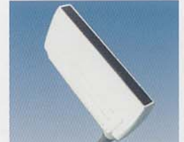
3.5 MHz 17cm Back Fat (2.5/3.5/4.5) Loin Eye/Rib Eye Marbling Includes Software