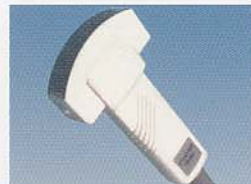
3.5 MHz 60R (2.5/3.5/4.5) Convex Array (Horses)