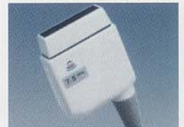
7.5 MHz 40mm (6.5/7.5/8.5) Tendon/Musculoskeletal