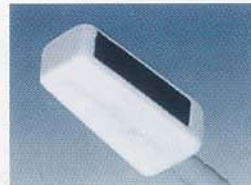
7.5 MHz 40mm (6.5/7.5/8.5) Tendon/Rectal/Bovine